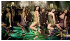
Slump Deflates Bollywood Bubble