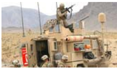
Retrofitting Iraq's Fleet for Afghanistan